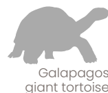
Galapagos giant tortoise