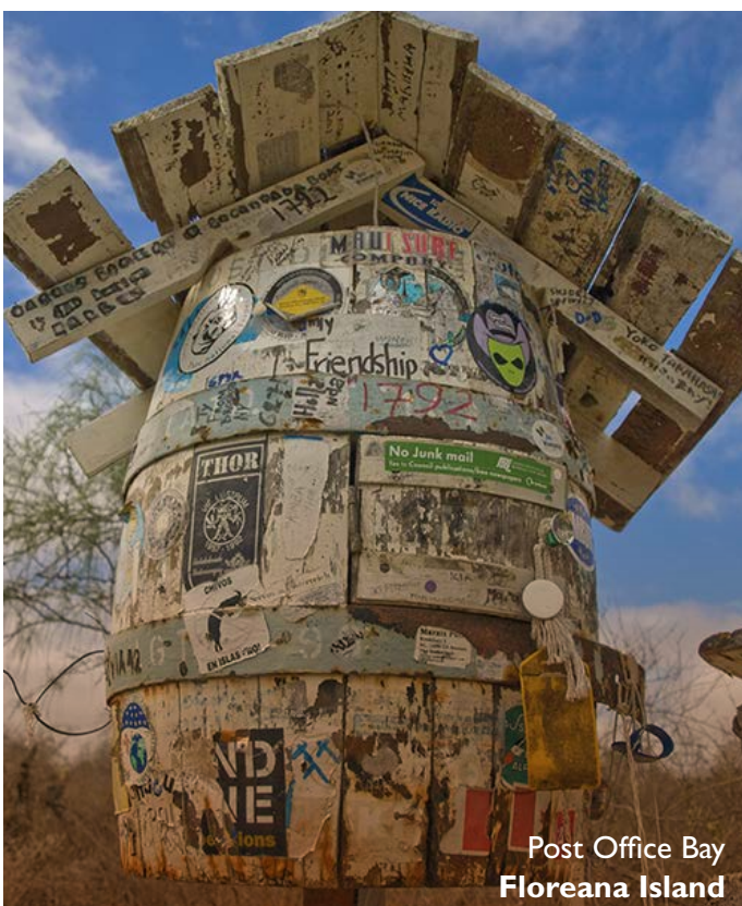
Post Office Bay Floreana Island

Located in the southeastern part of the Galapagos, this island was formed from an uplift instead than a volcanic origin, this is why is mostly flat. There are some theories which assure this could be the oldest island in the Archipelago. Santa Fe is the home of a number of endemic species like the Galapagos Hawk, Galapagos snake, Galapagos mockingbird, rice rats and one of the two species of lands Iguanas of the islands. After disembarkation in the beautiful and clear waters you will be in contact with one of the many sea lion colonies. Along the trail many salt bushes can be seen as well giant Prickly pear cactus, gigantism is a characteristic of oceanic islands.