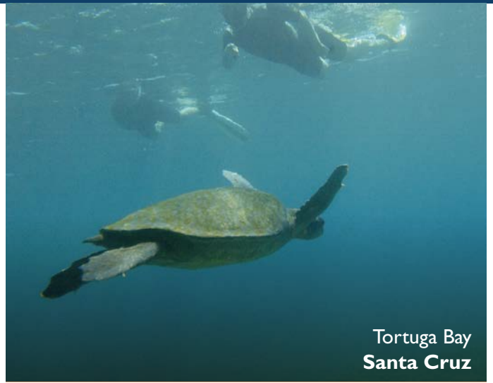
Tortuga Bay Santa Cruz

Assisted by the naturalist guide and some crewmembers, the dinghy will bring you and your luggage to Baltra Airport, where we will take the shuttle back to the airport.